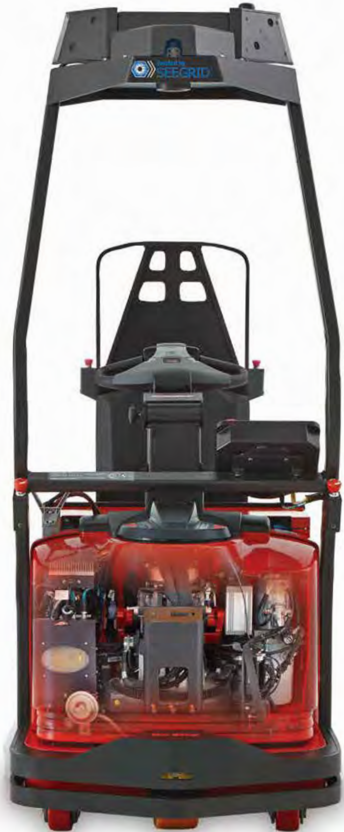
The Raymond Courier is built upon Raymond's durable and efficient pallet truck design - engineered with Best-in-Class components and then tested and calibrated for longer vehicle and component life.