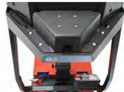
Advanced vision-guided technology captures image data from its surroundings, recording everything from turn locations, changes in speed, and when and where to drop a pallet.