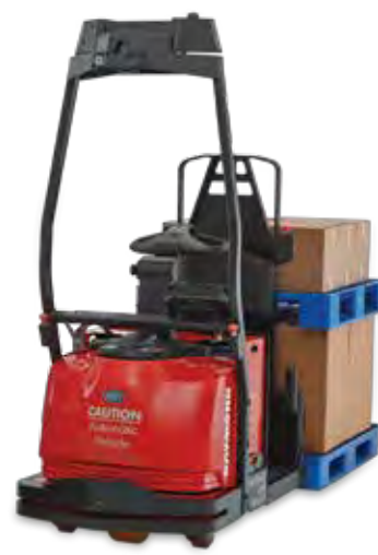
Raymond Courier Model 3010 Center Rider Pallet Truck