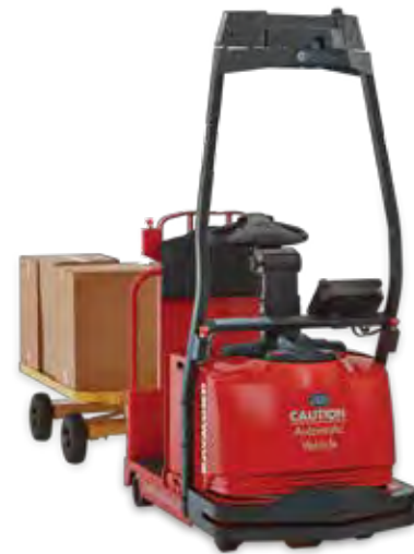
Raymond Courier Model 3020 Tow Tractor

The Raymond Courier paves the way for a new category of lift trucks. As warehouse managers bring more Raymond vehicles into their fleet, warehouses become more efficient. And you can count on Raymond to continue to be a leading innovator in the material handling industry. Contact your local Raymond authorized Sales and Service Center for an on-site consultation to see if the Raymond Courier is right for your operations.