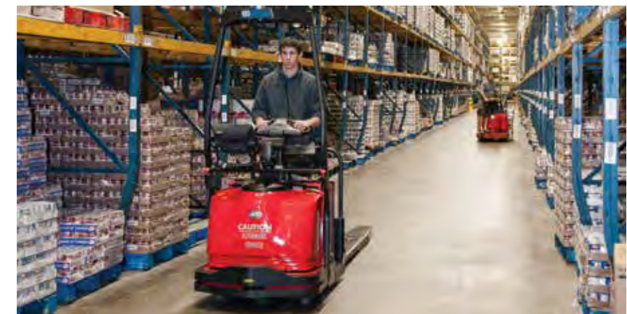
Program typical horizontal travel functions such as pauses, stops, horn honks and pallet drop-offs.

The Raymond Courier was designed to deliver the efficiency and productivity that Raymond products are known for. We call it Eco-Performance. You'll call it economizing without compromise. And Raymond's exclusive ACR System uses less energy than comparable AC systems. This allows for more uptime and keeps recharging time and energy costs to a minimum.