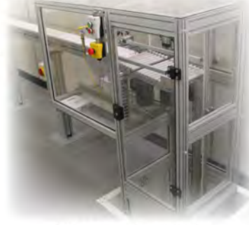
Mezzanine Floor Lifter