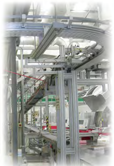
Complete Distribution System