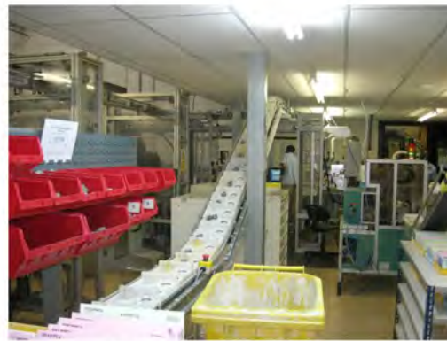
Friction Chain Decline