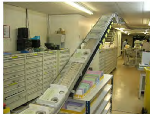
Friction Chain Incline