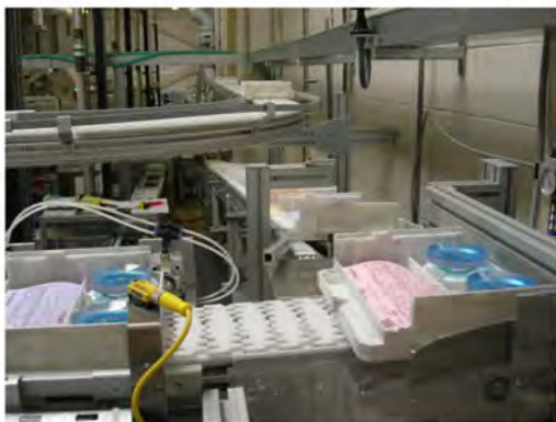
Side Push Unit