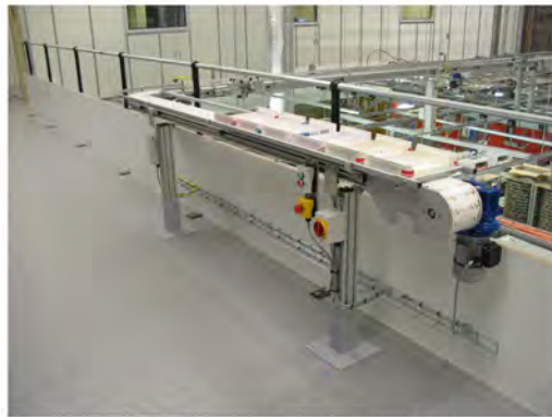
Feed onto Mezzanine Floor