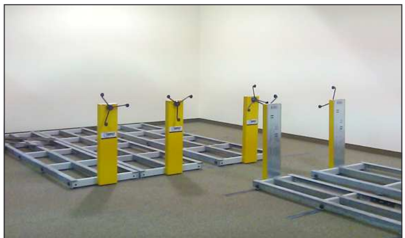
Active File Storage Area Under Construction.