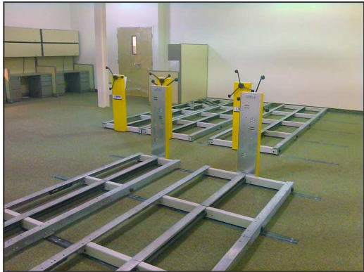
Standing here: View of new mobile shelving system to store the fire proof file cabinets.

New mobile carriages can be added in this space as necessary to meet Lonza's future needs.