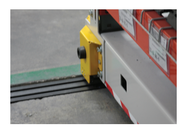
Recessed rails on the ActivRAC system create a smooth surface for forklift travel.

Jim Smith and the San Antonio office of Southwest Solutions Group, an authorized Spacesaver® Industrial™ distributor, recommended an ActivRAC™ mobilized storage system. Manufactured by Spacesaver Industrial, the ActivRAC system designed for TMMX is built with mobilized carriages that move side-to-side on a rail system. The industrial-grade carriages, which ride on wheels mated to rails, can be configured with existing or new pallet racking, shelving and cabinets. In this instance, TMMX was able to use existing pallet rack. Users decide how many carriages to move at a time opening an aisle only where needed to eliminate unnecessary aisle space – and as much as double the amount of storage space in the same footprint.