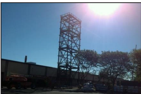
Outdoor Shuttle XP VLM Enclosure