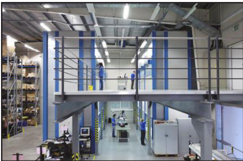
2-Story Kardex Remstar Shuttle XP VLMs