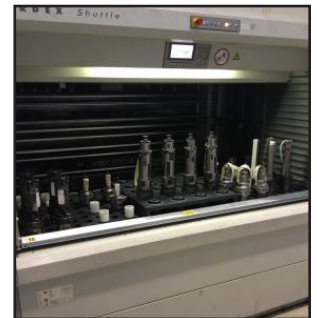
Operator can pick tools quickly in an ergonomically correct position.

The project resulted in an 80% decrease in area needed to store service parts . The Shuttle XP VLMs, interfaced with Kardex Remstar's FastPic software, allowed additional equipment to be kept in stock to better meet their customer's needs. The FastPic software allowed for greater inventory control and security of expensive components.