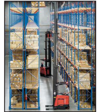
Raymond reach truck used in narrow aisles.

A leader in the CNC rotary table business utilized 3 Kardex Remstar Shuttle XP Vertical Lift Modules (VLM) with FastPic software, coupled with a new narrow aisle pallet rack layout, to increase storage and productivity. The company saved the cost of new building construction with these changes. The project resulted in a 42% increase of palletized products stored in the same footprint as well as 53% space savings for small parts inventory .