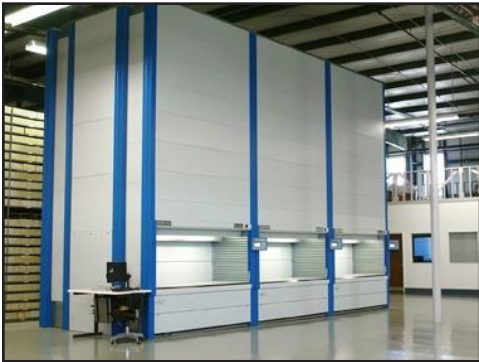
3 Kardex Remstar Shuttle XP VLMs