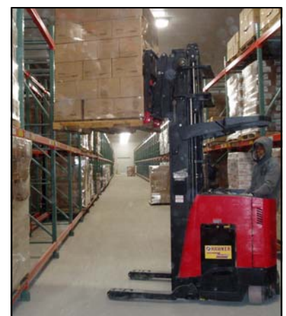
Raymond 7400 deep reach truck was used to accommodate the new freezer rack system.