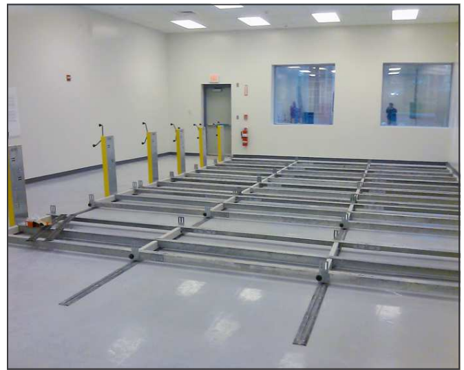
PD Storage Area During Construction.