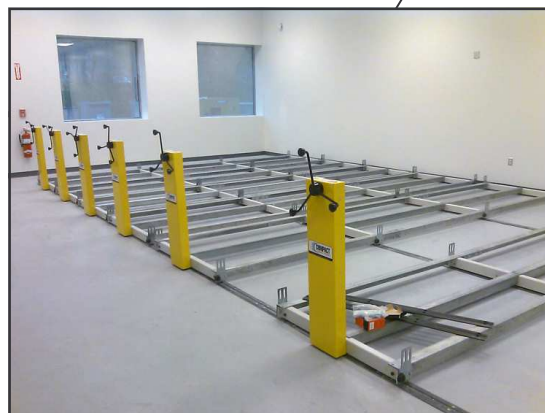
Standing here: View of new mobile shelving.